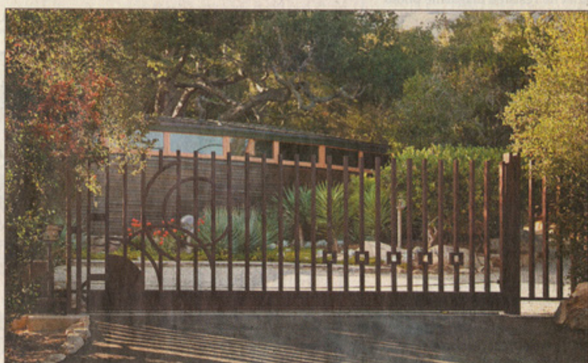
Ornamental Gates: 960 Lilac Drive, Montecito