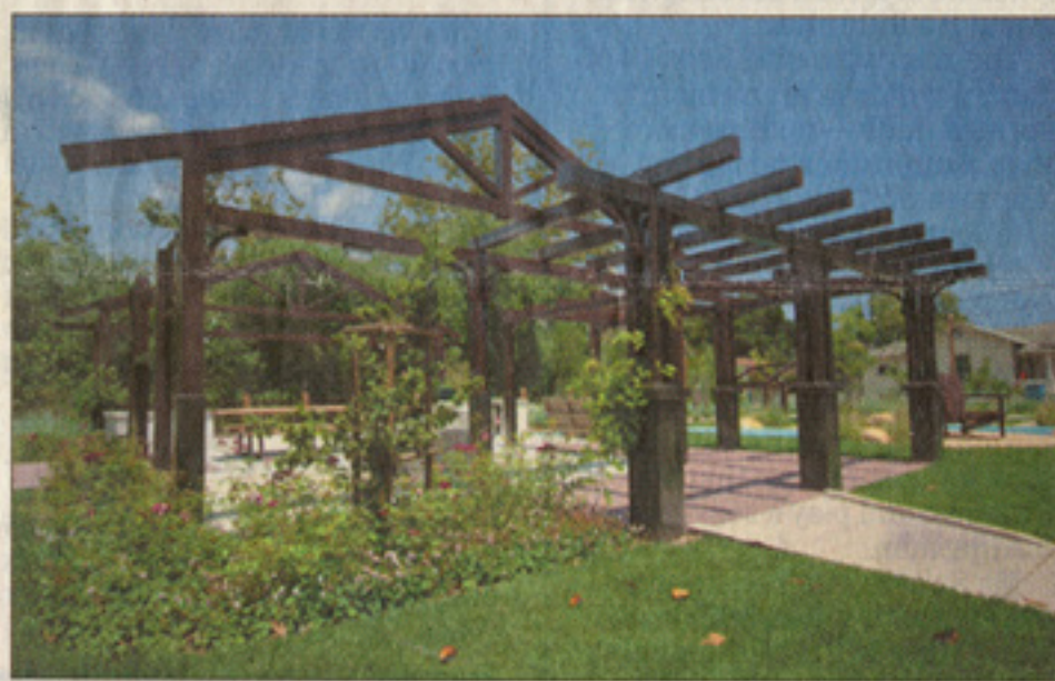
Open Public Space: Bohnett Park Expansion, 1300 block of San Andres St.