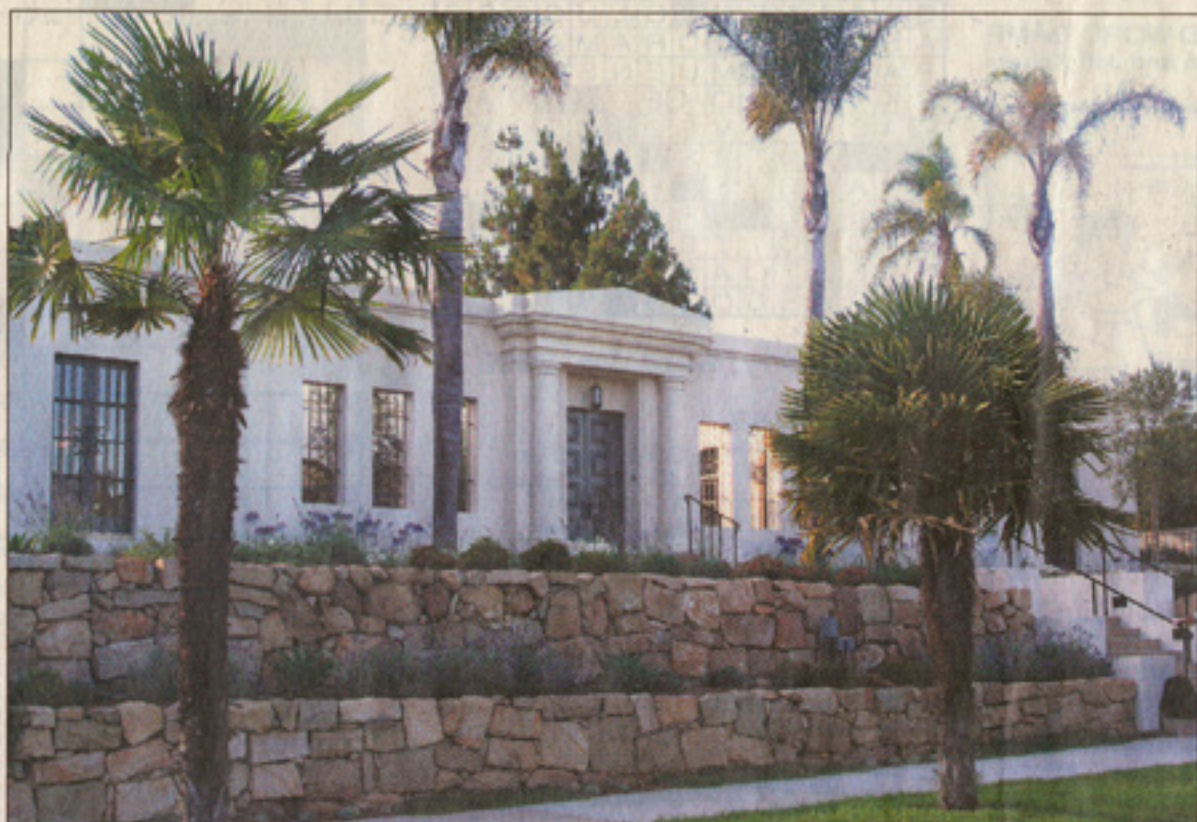
Single Family Residence-Large: Villa De La Guerra, 333 Junipero Plaza